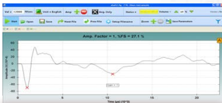
Olson's FTG Software showing sonic echo waveform